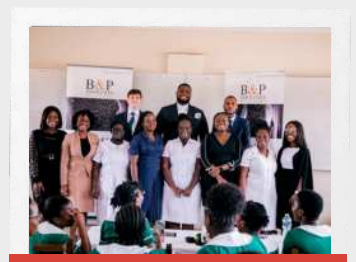
Legal Clinic to Educate Trainee Nurses on Medical Law