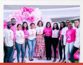
Painting in Pink Event to Raise Funds for Breast Cancer Patients